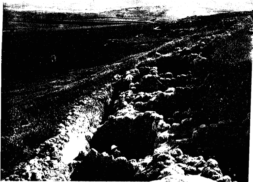
Beth Shemesh—Section of the North Wall—Valley of Sorek on the left—Judean Hills in Distance