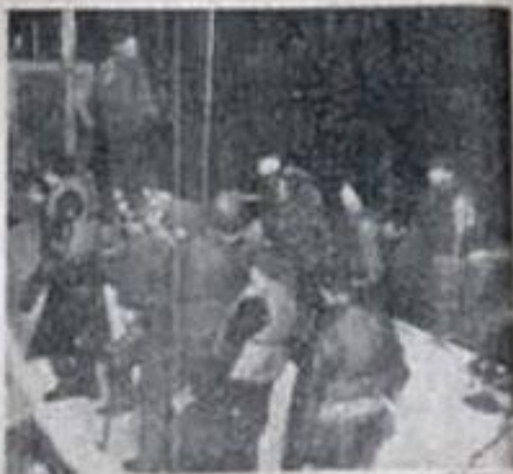
CREW OF ONE OF THE TANKERS WERE RESCUED BY THE COAST GUARD OFF CHATHAM.

Snow began to fall in the city at 10:30 p. m. after the storm had been in progress for several hours. The snow was heavy and it fell in drifts. The wind was strong and it was blowing from the north. The snow was very white and it was very soft. The snow was very deep and it was very heavy. The snow was very white and it was very soft. The snow was very deep and it was very heavy.