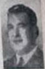
CAPTAIN OF THE TANKER BOSTON.

The last radio message that was received from the ship was at 10:30 p. m. when it was reported that the vessel had broken in two. The ship was about 30 miles out in the sea. The rescue fleet was alerted and the search was on. The ship was found in the morning. The crew was rescued. The ship was broken in two. The bow half sank. The stern half was found. The crew was rescued. The ship was broken in two. The bow half sank. The stern half was found.